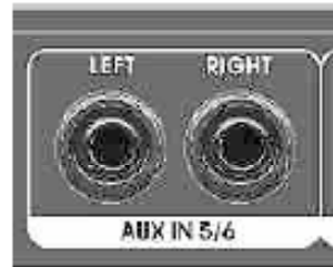
Aux In connectors

The mic channels each have a direct Line Out on the rear panel. So, on Channel 1 with the Rode on it, I run a line from the direct out into the Nanoverb. Then from the Nanoverb I run left and right line outs into the Aux In sockets on the MIXXMaster.