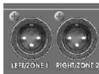
Left and Right Main Outputs

When I've got the vocal tracks all down, it's time to call it quits and start the mixdown. If I'm happy with the music 'mix-so-far' that I did earlier, then I'll just layer the vocal tracks on top.