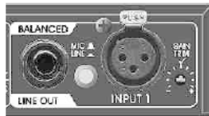
Mic Input 1

Fig 1 shows the typical Mic pre setup. The mic is plugged into Channel 1 of the MIXXMaster. The output of the MIXXMaster goes to the sound card inputs, with a split to the Aux In of the amplifier for monitoring. The output of the sound card goes into the Tape In of the amp.